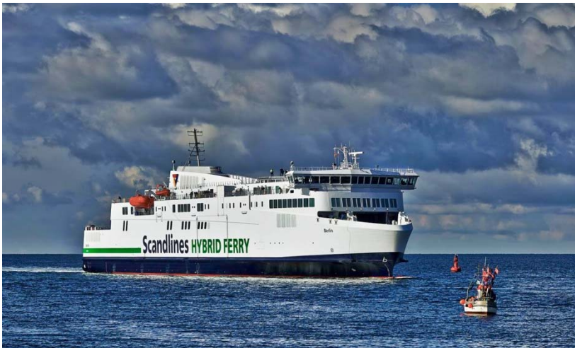
The final Scandlines hybrid ferry is driven by traditional diesel power combined with an electric battery operation.