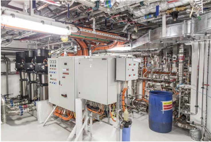
It is crucial to ensure integrity in cabinets in the main engine room.